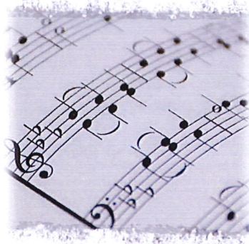
Psalm 13:6, ND8V

I will sing to the LORD because he has dealt bountifully with me.