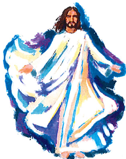
He was transfigured before them ... and his clothes became dazzling white ... Mark 9:2-3, NRSV