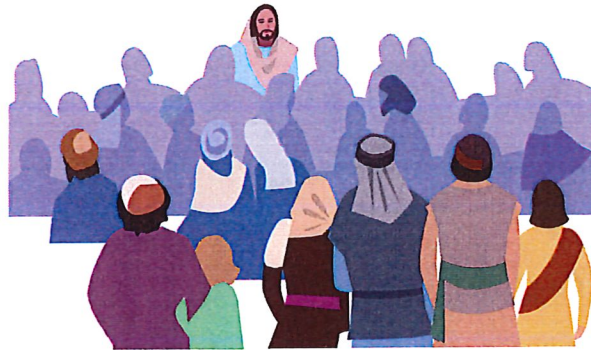
Jesus Has Compassion on the Crowds